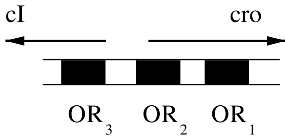
FIG. 1. Right operator complex, O_R , consisting of the three operators O_{R1} , O_{R2} , and O_{R3} . cI is transcribed when O_{R3} is free and O_{R2} is occupied by CI. cro is transcribed when both O_{R2} and O_{R1} are free. CI dimers bind cooperatively to O_{R1} and O_{R2} .

unspecifically to DNA [2]. We further use a formula analogous to (4) to compute and subtract the expected number of CI and Cro bound to a second operator site O_L , and finally assume that the bacterial and viral genome are, on the average, present in three copies in the cell [8]. The reference values for the binding free energies are shown in Table I, and the other numerical constants discussed above in the caption to that table. We note that f_{cI} has been directly measured in the absence of Cro [16], and agrees well with the parametric representation given by (3). The model is conveniently visualized by the phase space plot in Fig. 2.